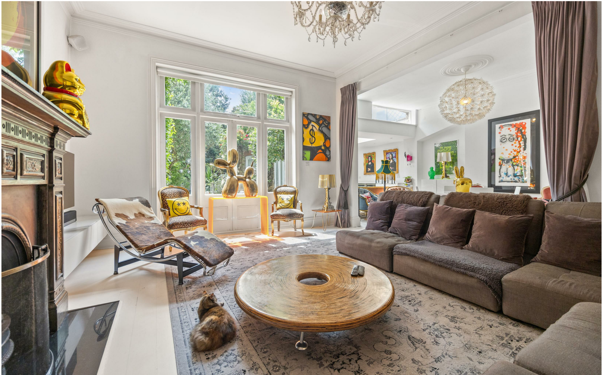
Goldhurst Terrace NW6